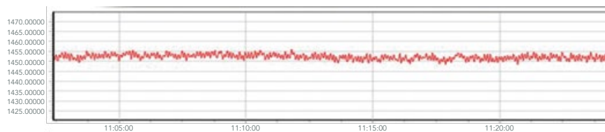
Figure 2. The same 1/4" ID fluid path with water, pumped the same industry-standard diaphragm pump with DMP-7000 installed between pump and flow meter. The difference between min and max flow is approx. 5 g/min at 1453 g/min nominal flow rate