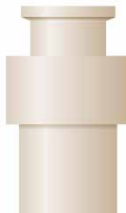
3/4 Mini Tri-Clamp