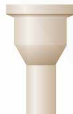
Fractional Mini TC