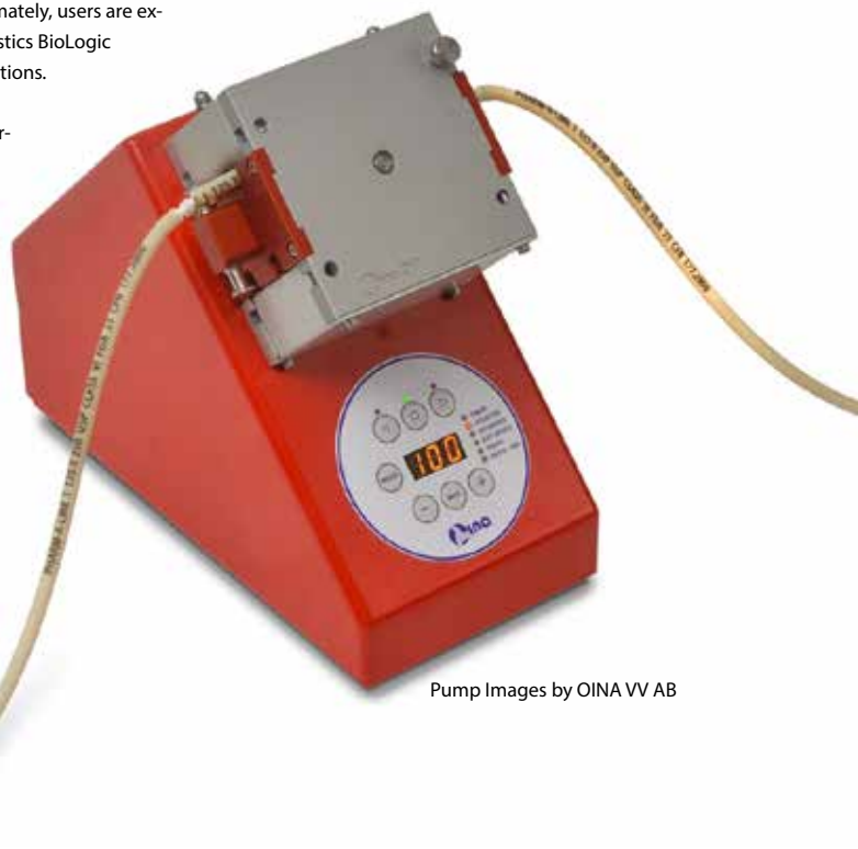
Pump Images by OINA VV AB